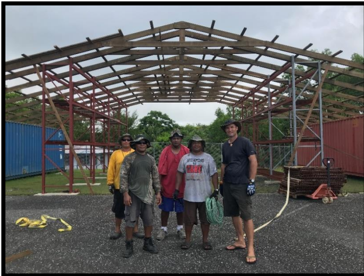
Our PMA Crew

We also had time to construct a shelter that I have had on my “to-do list” for a couple years now. This shelter will be to protect on of our grounded aircraft for deteriorating outside in the elements. It can also be used for painting aircraft under, and for storage of large outdoor equipment. Our crew of 5 were able to construct the building in just over a month. It was a fun project and we are excited to have that added space for our operation.