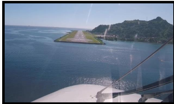
Landing in Chuuk after first leg home.