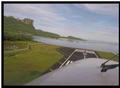
Departing Pohnpei on my way home.

I praise the Lord that the aircraft performed perfectly without any hiccup the whole way, and weather was mostly good except for one portion of the route near Woleai where I had to skirt around some heavy rain. It was a lot of ocean to cross, and my back was pretty sore from sitting so long, but now I am happy to be home. We met the needs of the people who requested the flight and even had some good interaction with government officials who will hopefully look favorably on us in future dealings in this country we are guests in.