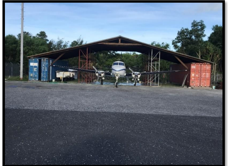
Aircraft is not the one to go inside but only parked to show the perspective