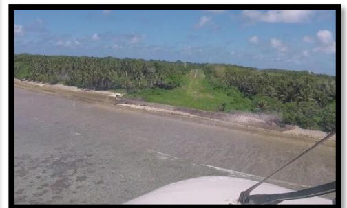
Landing in Woleai on the way home.

We thank you all for your continued support, prayers and encouragement, especially during this time of uncertainty in the world. You are a blessing to us, AND to the people of Yap. These remote islands are very dependent on our flights to bring them hope, whether it is by bringing supplies, carrying out their sick, or transporting people where they need to go. We enjoy a close relationship with the island communities and have become part of the family. We believe that relationships are key for opening the door to evangelism. We have seen many doors open, due to the years of service that PMA has provided here in the islands. Pray that He continues to open doors and touch people's lives.